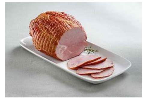
2. Bouchiers St Benards Free Range Ham Nugget (800g-1.2kg) $35.00

1. Bouchiers St Bernards Free Range Boneless Slicing Ham skin on (4kg-5kg) $38.00kg